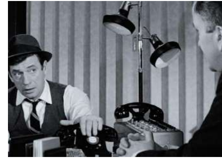
Costa-Gavras/ France / 1965 / 105 mins Yves Montand, Simone Signoret, Michel Piccoli, Jean-Louis Trintignant

Best Film National Board of Review USA, 1967