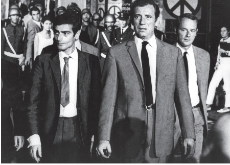
Costa-Gavras / France / 1969 / 125 mins Yves Montand, Irene Papas, Jean-Louis Trintignant