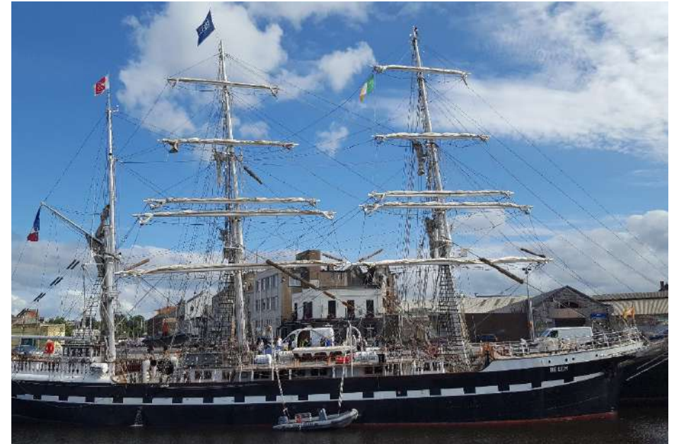
The Belem moored at Albert Quay during her last visit to Cork in July 2017.