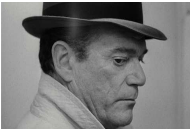
Image: Alphaville by Jean-Luc Godard